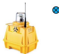
SP-401 LED TAXIWAY LIGHT