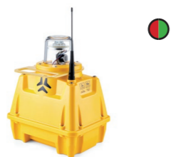
SP-401 LED RUNWAY THRESHOLD END LIGHT