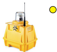
SP-401 LED RUNWAY EDGE LIGHT