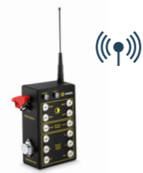
UR-101 HANDHELD CONTROLLER