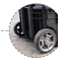
WHEELS FOR EASY TRANSPORTATION