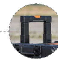
TELESCOPIC CARRYING HANDLE