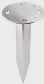
6X MOUNTING STAKES FOR GRASS