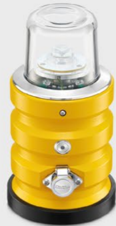
6X PORTABLE HELIPAD LIGHTS